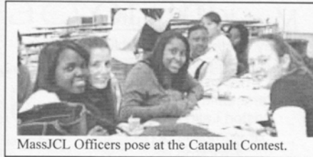
MassJCL Officers pose at the Catapult Contest.

The MassJCL wants candidates to be committed to whatever job they pursue and try their hardest to fulfill