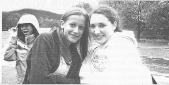
Delegates from LHS smile during a break in the rain at the Catapult Contest