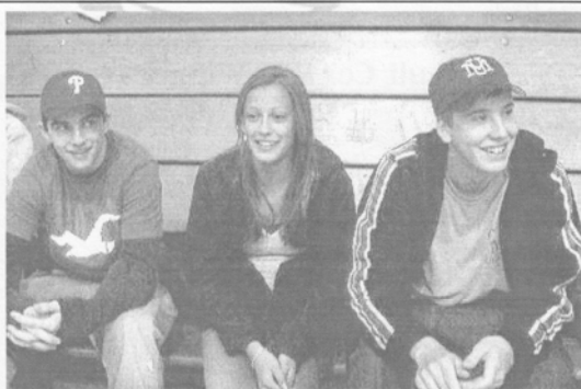
MassJCLers relax and watch the Marshmallow Contest

This is a brand new endeavor for us. New events such as a sundae party, outdoor movie, open certamen and a longer dance are just a few of the things we have planned for you. Even some old favorites have a new twist, such as ludi sudoku and ludi water balloon freeze tag. All of these additions and changes have been made so that you can have the best possible time at States. This convention is for you, and if you have any good ideas of what you would like to see at States, whether it be a favorite song you want played at the dance, or another cool ludi event, don't hesitate to contact any one of the officers. I want you to have a great time, and to always hold the memories of this convention dear to you.