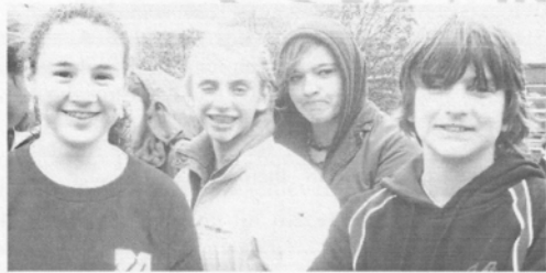
MassJCLers smile outside Mt. Greylock Regional School

Abby Kelley Foster Charter Public School Austin Preparatory School Bancroft School Barnstable High School Boston Latin Academy Boston Latin School Brockton HS Brookline High School Buckingham, Browne and Nichols Cambridge Rindge and Latin Catholic Memorial Coyle & Cassidy Franklin High School Lunenburg High School Lynn English High School Lynnfield High School Mansfield High School Milton High School Mt. Greylock Regional School Nashoba Brooks School North Attleborough High School North Middlesex Regional High School Notre Dame Academy Pierce Middle School Pittsfield High School South Hadley High School St. John's Preparatory Tewkesbury Memorial High School Turkey Hill Middle School Wachusett Regional High School Walpole High School West Middle School Westford Academy