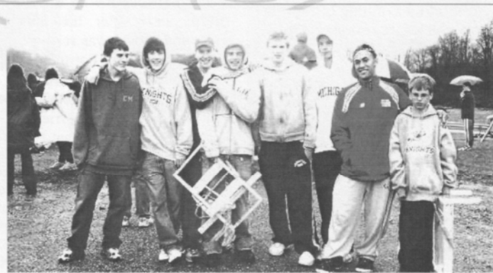
The boys from Catholic Memorial pose before departing.

The last thing I did was attempt to make my catapult look presentable. Now I felt that it was ready to be launched. When I first arrived, I was intimidated by all of the other catapults, but in the end I placed first! I had tons of fun building the catapult, and I encourage everyone to enter next year's Catapult Contest.