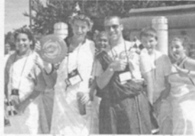
MassJCLers pose at the Toga Parade.