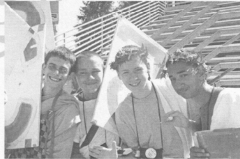
MassJCLers stop for a picture as they get ready to cheer.

All in all, the convention was awesome. I got in trouble for being too loud at two in the morning, and I had a great time making new friends from across the country. The spirit contests, the dances, and everything was just so full of energy and life. I am already looking forward to next year's National convention.