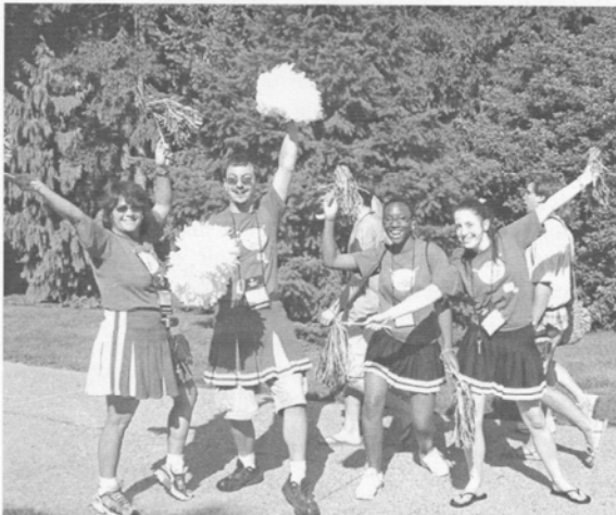
The MassJCL may not have any real cheerleaders in the delegation... But we've sure got spirit!

Saturday was the last day we were there, and as we arrived home I asked myself whether or not it was all worth it. After all the late nights, all the GA's and ear-splitting spirit contests, meeting so many different people from all around the country, and sprinting from fellowship to the dorm for pizza before curfew, I wondered, "was it really worth it?" The answer: absolutely. I had a great time, and would definitely go back next year.