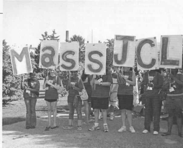
MassJCLers prepare for the first spirit competition at the 2006 NJCL convention at Indiana University.

My experience as a first-time delegate was life changing and so completely different than what I had anticipated that it took me a full week to recover. I had so much fun and I learned so many things that I feel as if I'm becoming a whole new person. All the work and dedication put into preparing for this trip turned out to be worth it; all the art projects, certamen homework, and plain old studying truly did pay off. I sacrificed two months of my summer to my studies! Although even I can't believe I did such a thing, I would not