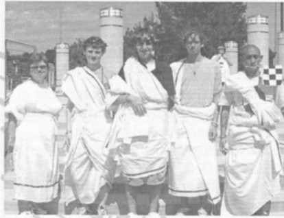
Toga-wearing CM delegates pose for a picture.

I took part in a variety of activities at the convention. I went to the Nomination