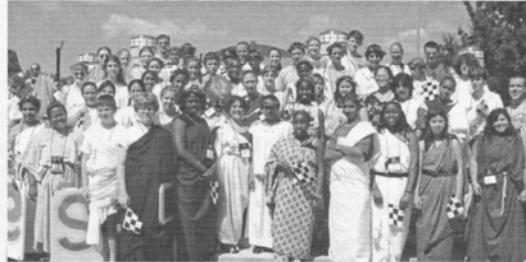
MassJCL poses at the Toga Parade.