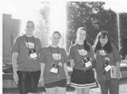
MassJCLers Pose by the Venus Fountain on the IU Campus.