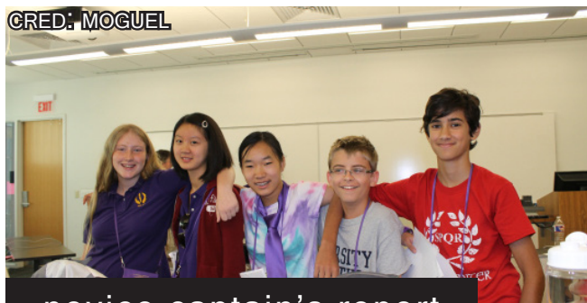
novice captain’s report

“Once again at toss-up nineteen it was anyone’s game”