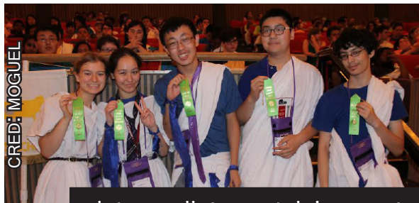
intermediate captain’s report