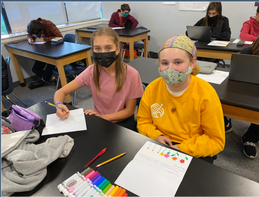
JCLers from Rising Tide writing letters.

Thanks to all for submitting, and we look forward to hearing about more service work done by our local chapters!