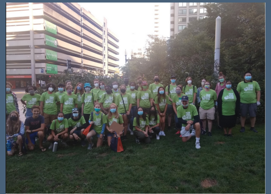
BLSJCL at the Boston Food Fest