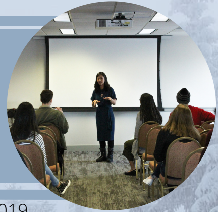
Boston Mayor Michelle Wu Speaking at Classics Day 2019

Classics Day is December 2nd at Boston University! Come enjoy classics themed lectures by professors.