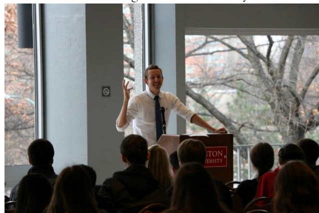
Inside a professor's workshop

Salvete JCLers! It was so nice to see you at Classics Day this past month and I hope you enjoyed it as much as I did. One of the best things about Classics Day for me is the