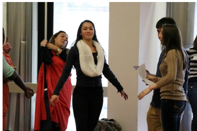
Behind the scenes of skit rehearsal with Barnstable High School

Also, I have now been able to establish the fact in my household that eating on the couch is extremely civilized as any Roman would tell you. Just remember, next time you want to borrow someone else's mappa (napkin) make sure you ask, you wouldn't want to be known as a regular old Marrucinius Asinius! Overall, the workshops I attended were all wonderfully executed and so much fun to be a part of. See you all next time JCL!