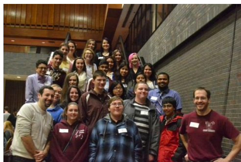
Preparing to go to workshops

In the first workshop, our instructor discussed the components of Lucretius' De Rerum Natura and how Lucretius used eloquent introductions to lure readers into