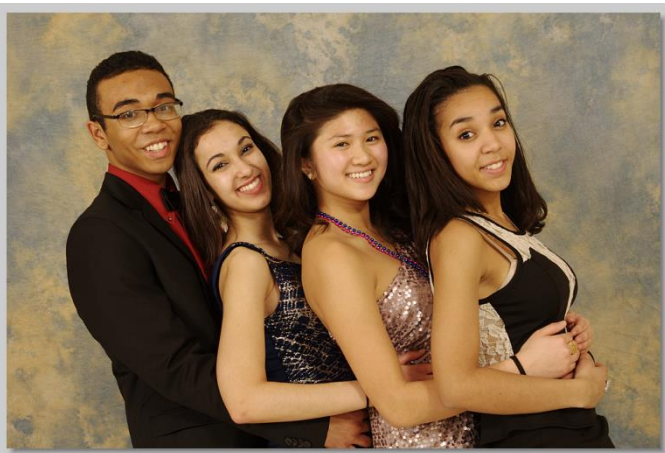
BLA Seniors unite!

Eventually, the night slowed down and people drifted to talk at the tables with their friends or get a picture together. We had a great turnout of around 100 JCLers and it definitely was a night to remember.