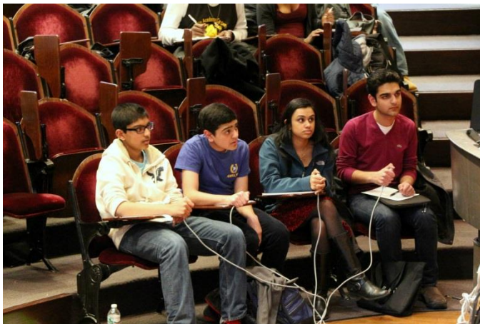
AMSA Advanced playing in the final round of Harvard Certamen

First Place: AMSA Second Place: BLA Third Place: Clark