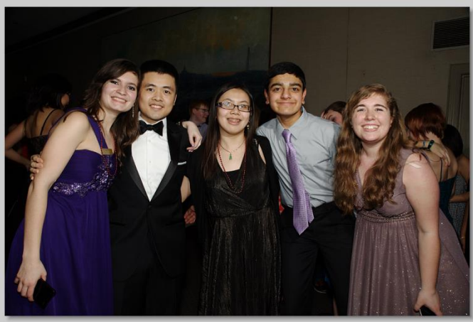
JCLers enjoying the dance