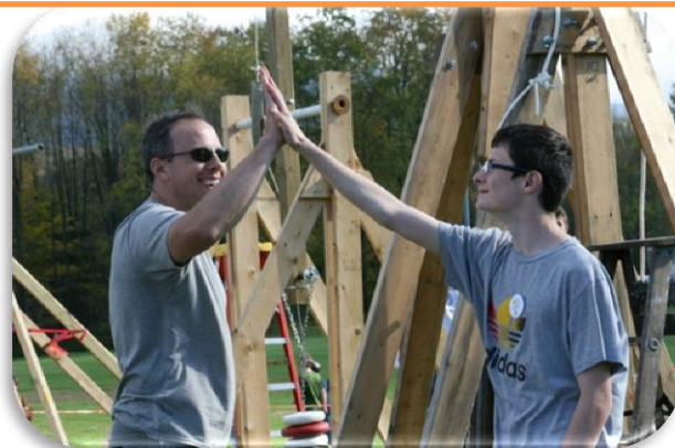
High Fiving after a great Catapult!