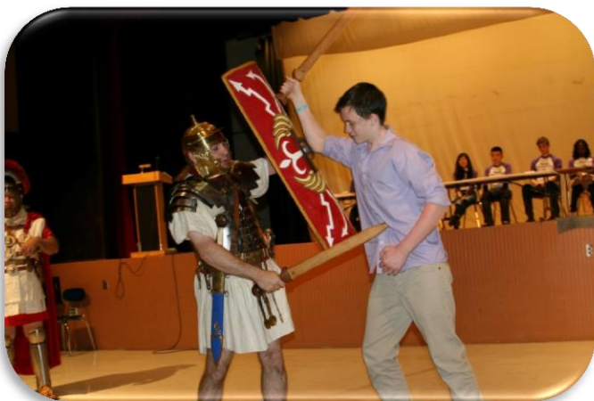
Legion III's demonstration