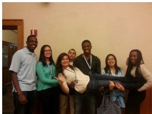
BLA certamen team and coaches